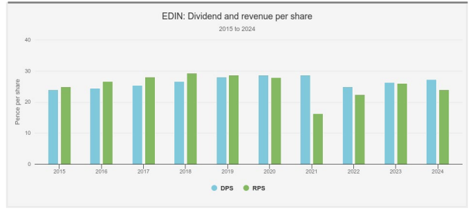
Fig.5: DPS & RPS